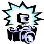
Photo Retake Day will be on Tuesday, November 3rd. In order to ensure delivery of all portraits before Christmas, portrait packages will only be made for students who submit a Photo Order Envelope with payment to the photographer on photo day. You can pick up a Photo Order Envelope at the school office. Please note that orders handed in after the second photo day require special processing and are therefore subject to a $10.00 handling fee. These orders will be processed separately from the school orders and mailed directly to the customer's home address.